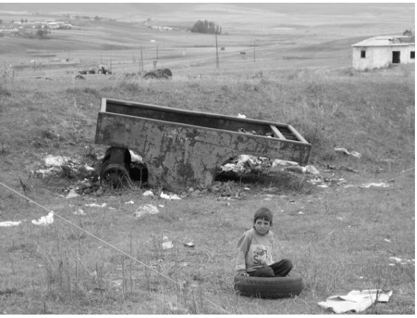
Kars, August 2007