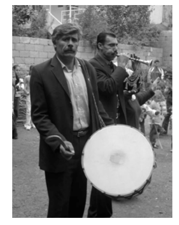
A wedding ceremony in Mardin, October 2006