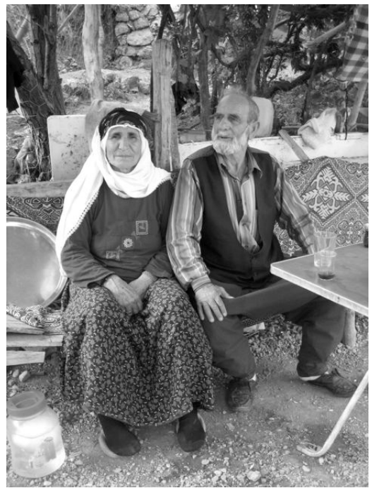
Lom husband and wife, in Artvin, Yusufeli Kınalıçam village, August 2007