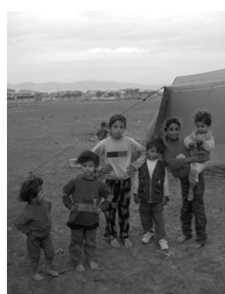
Gipsy children in Mardin, October 2006