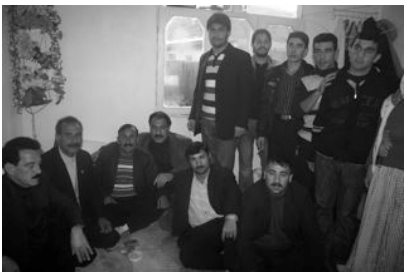
Diyarbakır Silvan, December 2006