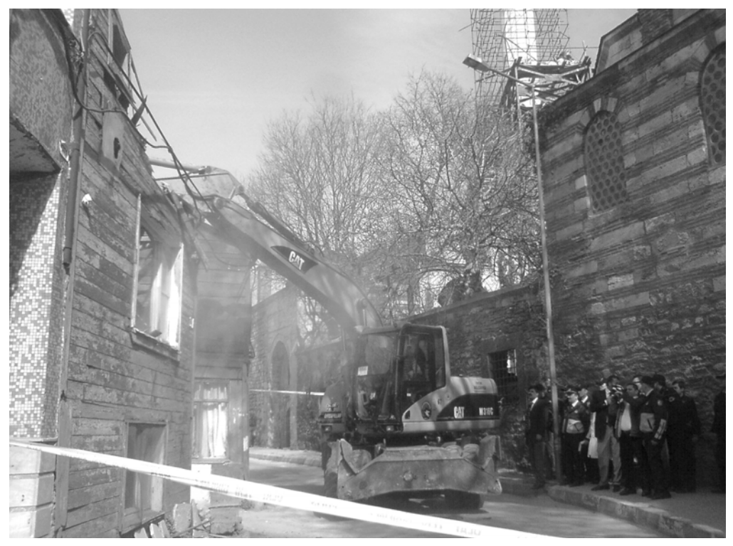
The demolition of a historical wooden house in Sulukule, October 2006