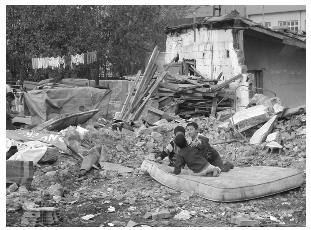
The demolitions in Sulukule / İstanbul, October 2006