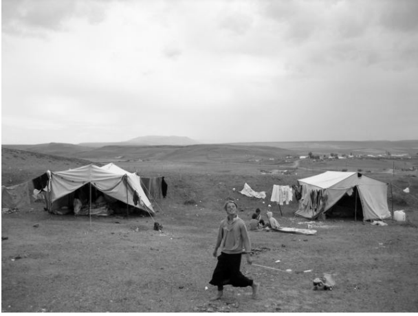
Roma tents in Kars, August 2007