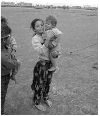
Gipsy children in Mardin, October 2006