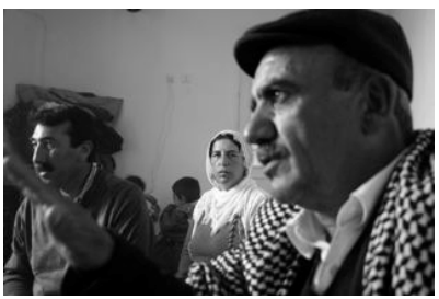
Diyarbakır Silvan, December 2006