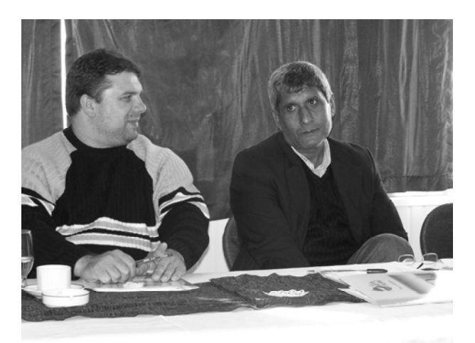
The capasity building training of the project, Mersin, November 2006