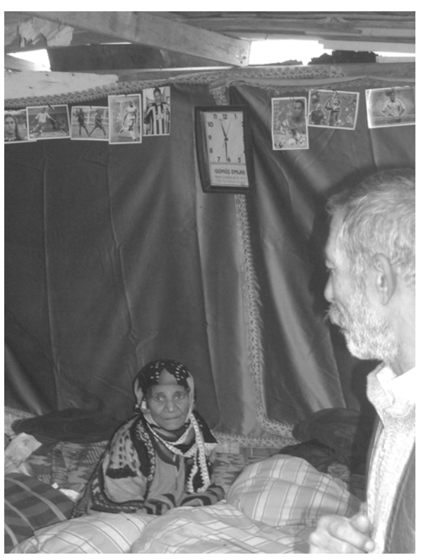
The Roma woman seen in the photo was living in a tent in the Küçükbakkalköy area because her house was demolished, and she died a few months after the photo was taken. September 2006