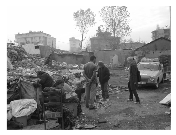
ERRC/EDROM/hCa team's visit to Küçükbakkalköy, September 2006