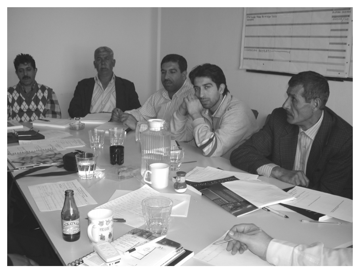
The human rights training of the project, İstanbul, November 2006